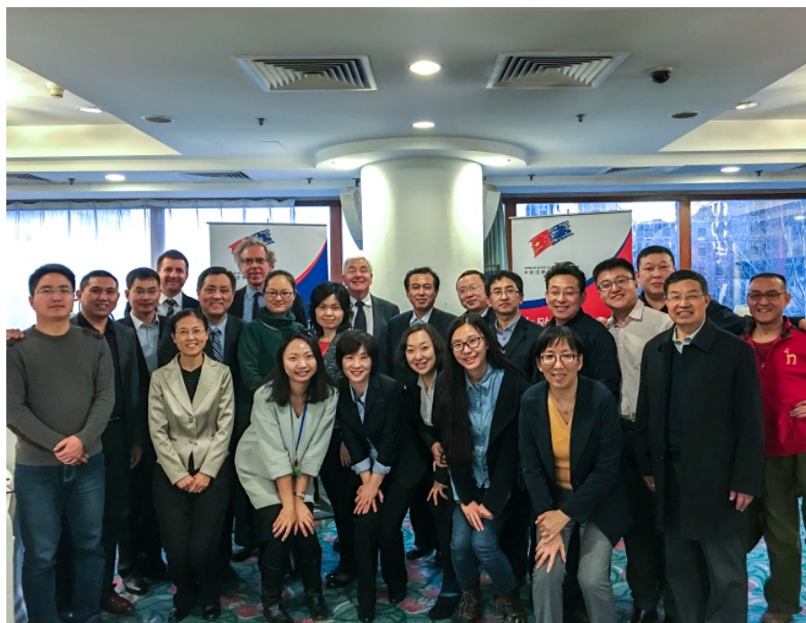
European experts with Chinese peer reviewers following a training in Beijing, March 2016.

Institute of Advanced Legal Studies, University of London