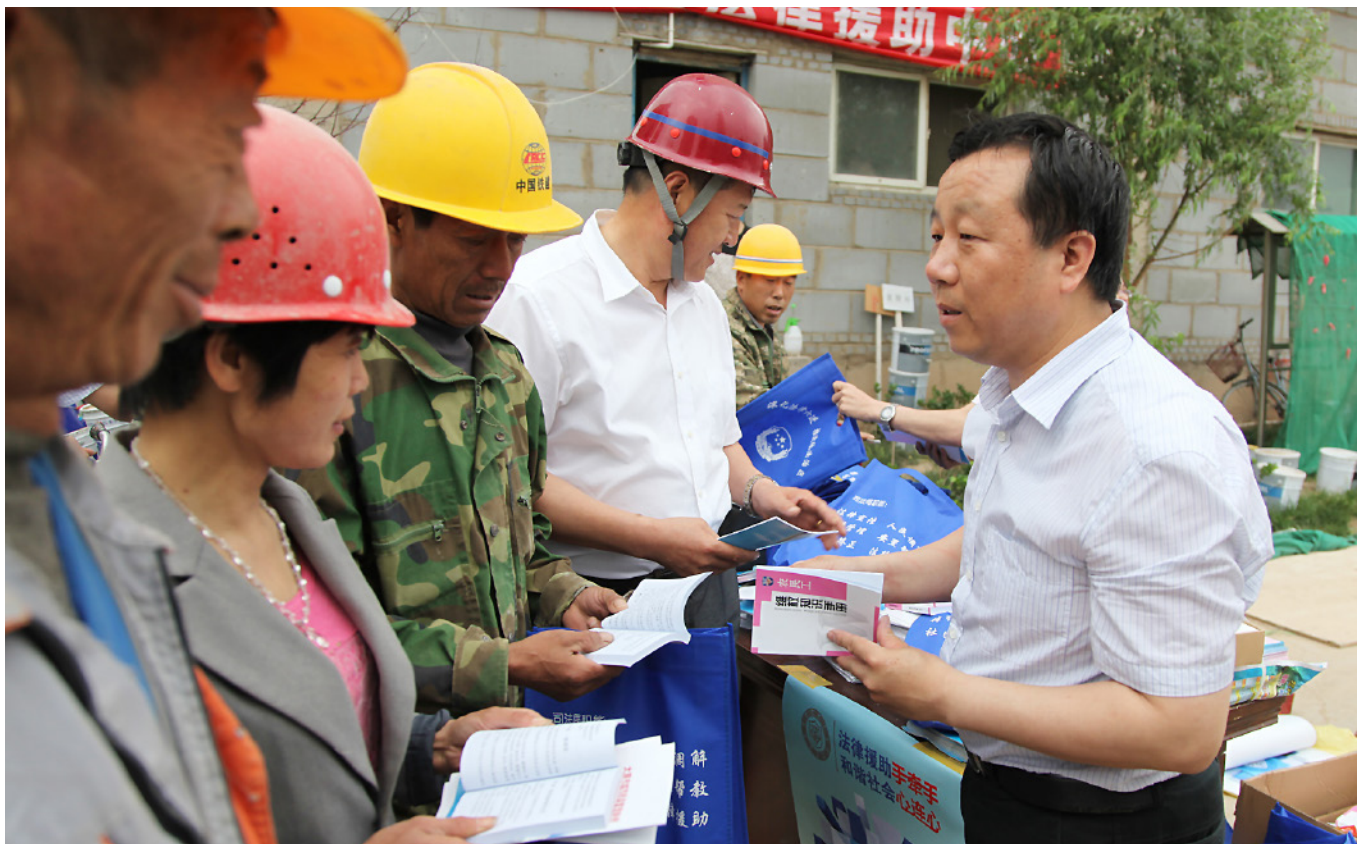
The Migrant Workers Legal Aid Working Station (NGO) collaborate with the Shanxi Provincial Legal Aid Centre to provide legal aid services at a local construction site.