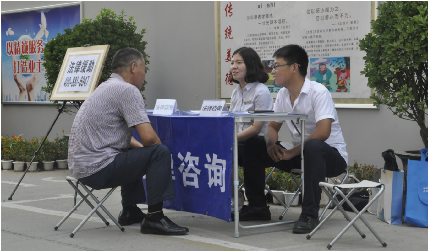
Voluntary lawyers visiting a community to provide on-site consultancy and disseminate legal materials to local residents.

Although the EU Access to Justice Programme is now completed, the ideas exchanged and relationships developed between European and Chinese counterparts will continue to bear fruit in China and Europe in the future.