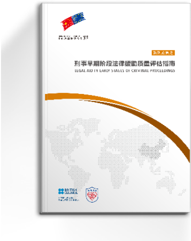
One of the toolkits developed with joint efforts by European and Chinese experts

The Evaluation Manual and training package are being distributed to legal aid centres, Provincial Lawyers' Associations and criminal legal aid lawyers throughout China by the Ministry of Justice and All China Lawyer's Association. International collaboration building on the outcomes of this programme is set to continue in the future through a planned cooperation between the Chinese Department of Legal Aid and UN Office of Drugs and Crime.