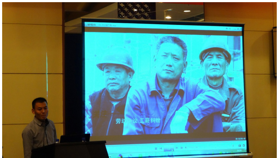
Training session in Taiyuan, Shanxi Province on how to develop public legal education products (June 2014).

Examples of European good practice in early intervention were shared during study visits and at a national workshop in Guangdong Province, which has developed what is considered to be the best telephone and online legal advice platform to date in China. Shanxi has established a video conferencing network linking all legal aid centres to the provincial capital in Taiyuan. The facility will make it possible for legal aid lawyers to meet ‘virtually’ with clients in remote locations, thereby saving travel time and expense.