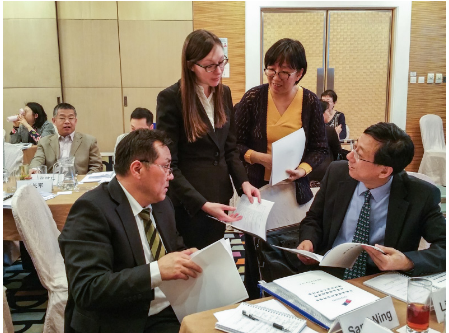
Discussing approaches and methods for training of criminal legal aid lawyers, Beijing, April 2016.

Over the past 50 years, European legal aid systems have tended to prioritise funding for criminal legal aid over civil legal aid, due in part to the fair trial obligation contained in the European Convention of Human Rights. Yet even in the EU, legal aid for criminal suspects at the police station is still a developing field with great differences between the Member States in the availability of or scope of services. Following the European Human Rights Court decision in the Salduz case and the recent adoption by the EU Council of a Directive on the Right to Legal Aid in Criminal Proceedings, Member States will from 2019 be required to provide legal aid to criminal suspects and accused persons without delay, at a minimum prior to the