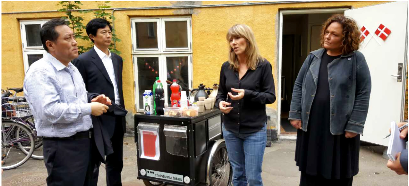
A Chinese delegation visit the 'Danish Street Lawyers' NGO to discuss how they provide legal and social assistance to drug addicts, sex workers, and the homeless in Copenhagen, Denmark (May 2016).

discussions and make recommendations on draft laws that may impact negatively on the legal rights or well-being of their clients.