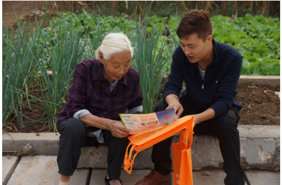
Legal aid lawyer providing consultancy to a villager at regular visit to villages as part of the 1:10:100 pilot.

During study visits, workshops and policy dialogues, gender-specific approaches to access to justice were discussed and