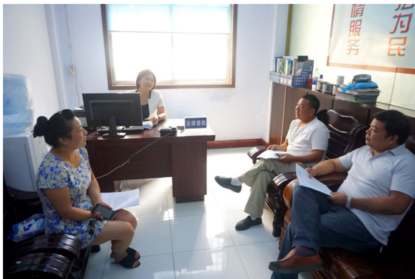
Legal aid lawyer in 1:10:100 pilot supporting legal aid station.