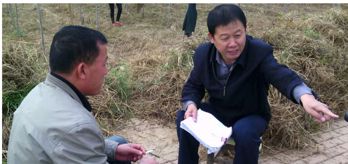
Legal aid lawyer providing legal advice to a village coordinator in Gaozhaduan village in relation to a local storage contract as part of the 1:10:100 pilot.