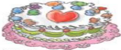
a birthday cake