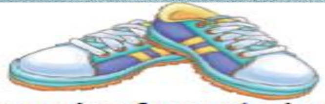
a pair of sport shoes