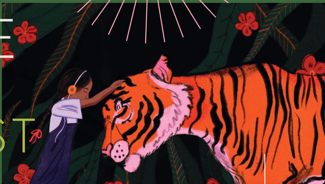
Songs of the Earth